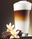
Vanilla Latte Macchiato